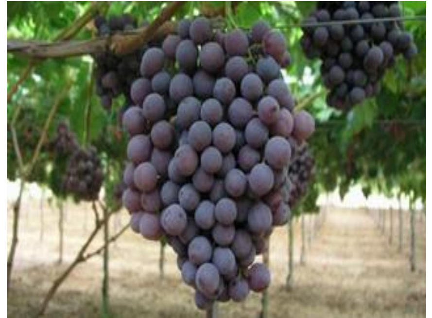
Apulia Rosa Seedless